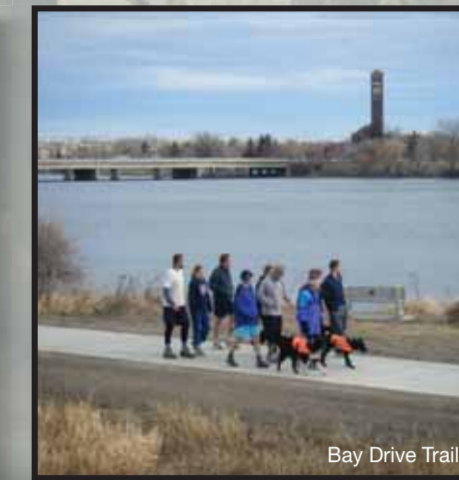
Bay Drive Trail

Recreational Trails, Inc. maintains a list of organized walks, runs, races and events on River's Edge Trail throughout the year at www.thetrail.org .