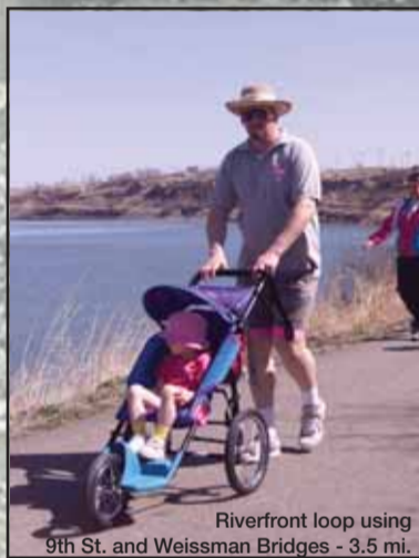
Riverfront loop using 9th St. and Weissman Bridges - 3.5 mi.