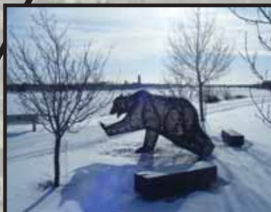
Black Eagle Memorial Island