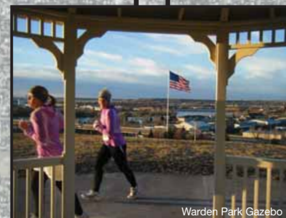
Warden Park Gazebo